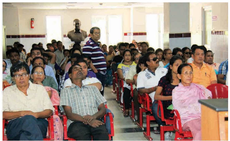
Out patient department